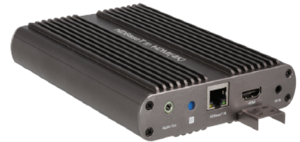
HDBaseT Receiver (Optional)